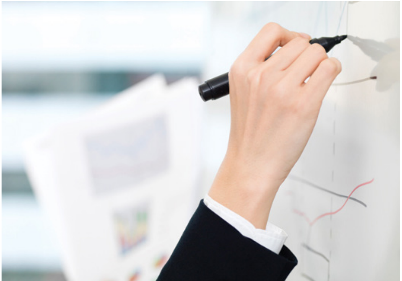
WriteNOW White • WWWO-WHITE