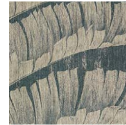
Surf & Sand