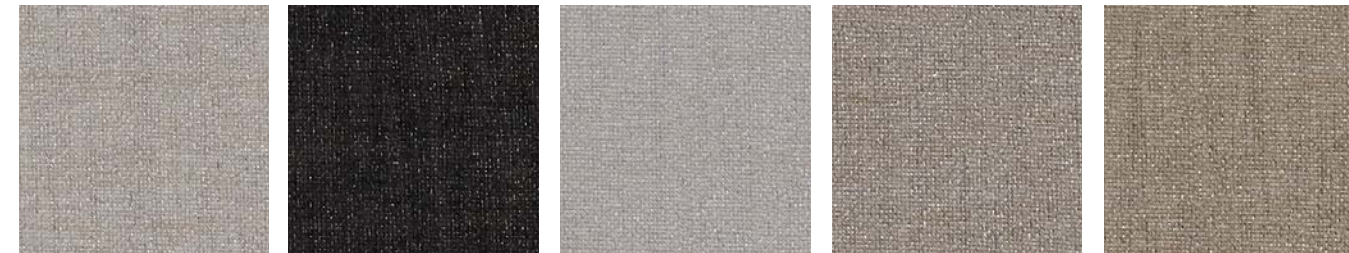
DN2-MTU-11 Lux Linen DN2-MTU-12 Pitch Perfect DN2-MTU-13 Carte Blanche DN2-MTU-14 Mesmerize DN2-MTU-15 Prosecco