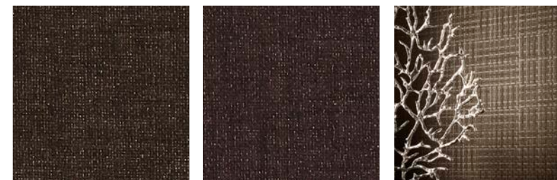
DN2-MTU-21 Molten Brown DN2-MTU-22 Black Orchid FOR SIMILAR TEXTURES CLICK HERE

Type II 20 oz | Width: 52"/54" | Backing: Non-Woven | Match: Random Match Non-Reversible Pattern Repeat 52"H x 24" V | Fire Rating: Class A | Flame Spread: 25 | Smoke Development: 55