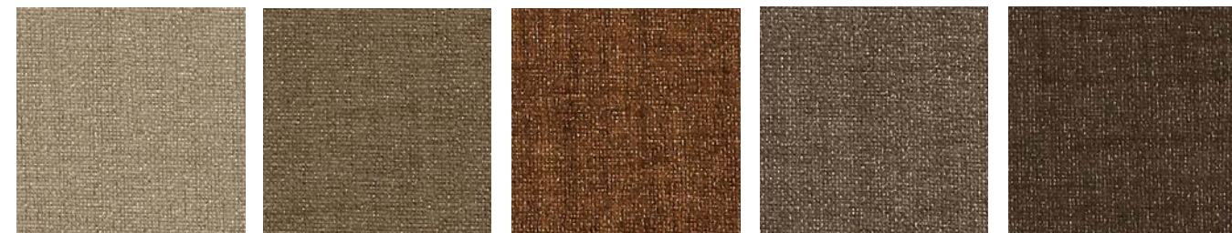
DN2-MTU-16 Golden Touch DN2-MTU-17 Gilded Burlap DN2-MTU-18 Eartha DN2-MTU-19 Polished Stone DN2-MTU-20 Bronze