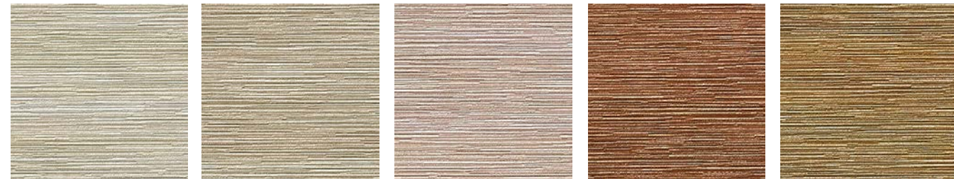
DN2-KRA-11 Origami Paper DN2-KRA-12 Sand Garden DN2-KRA-13 Taiko DN2-KRA-14 Pogoda DN2-KRA-15 Koi Gold