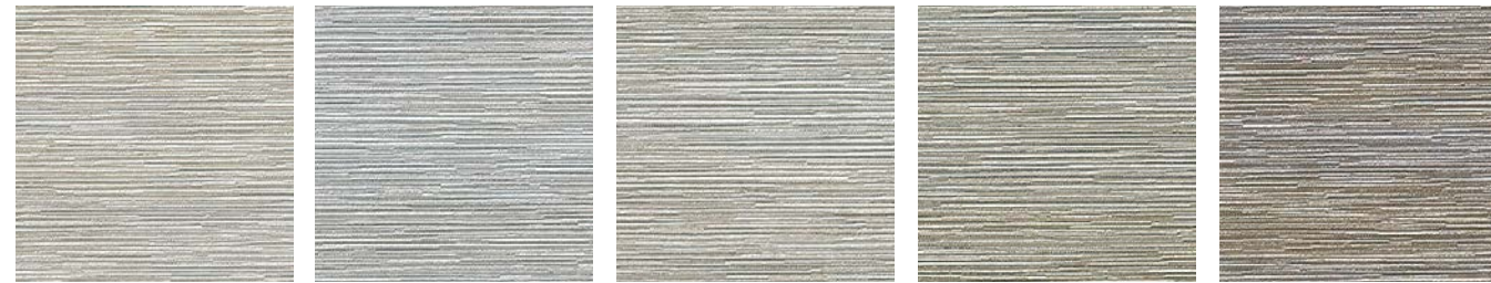
DN2-KRA-01 Skylight DN2-KRA-02 Snow Moon DN2-KRA-03 Pacific Log DN2-KRA-04 Infinity DN2-KRA-05 Tranquility Stone