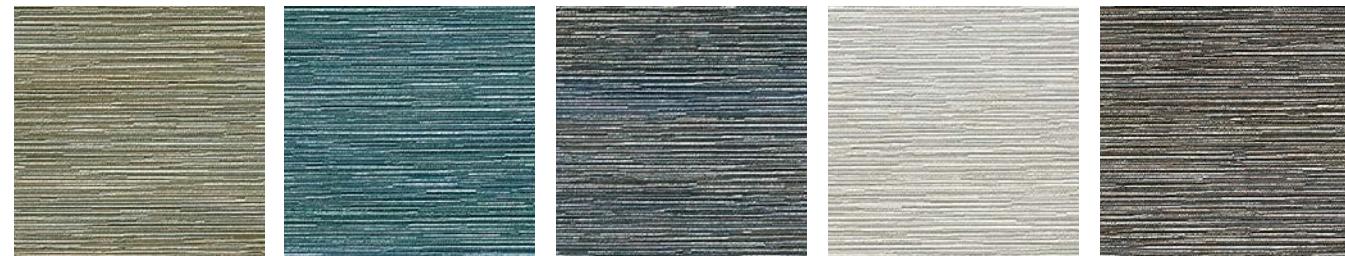
DN2-KRA-06 Stonebridge DN2-KRA-07 Lily Pond DN2-KRA-08 Indigo Wash DN2-KRA-09 Shoji White DN2-KRA-10 Black Sand