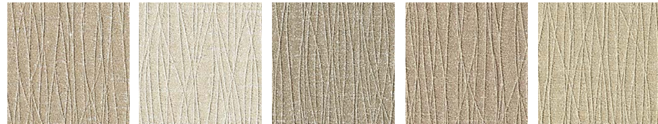
DN2-JEM-11 Shimmer DN2-JEM-12 Taj Mahal DN2-JEM-13 Sandcastle DN2-JEM-14 Soleil Gold DN2-JEM-15 Corn silk