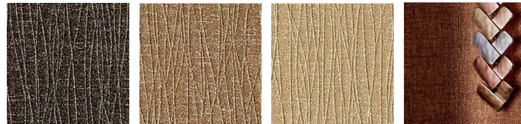
DN2-JEM-16 Indulgence DN2-JEM-17 Panela DN2-JEM-18 Radiant FOR SIMILAR TEXTURES CLICK HERE

Type II 20 oz | Width: 52"/54" | Backing: Osnaburg | Match: Random Match Reversible Pattern Repeat 27"H x 24" V | Fire Rating: Class A | Flame Spread: 25 | Smoke Development: 45