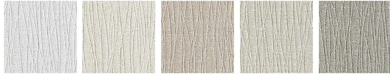
DN2-JEM-01 High Beam DN2-JEM-02 Sugar Coat DN2-JEM-03 New Taupia DN2-JEM-04 Mirror Mirror DN2-JEM-05 Silver Threads