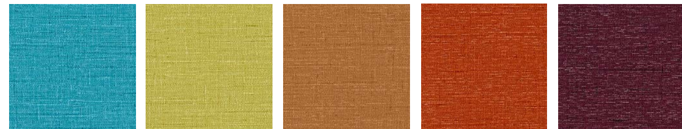
DN2-ELS-32 Cayman DN2-ELS-33 Lemonata DN2-ELS-34 Lantana DN2-ELS-35 Dragon Fire DN2-ELS-36 Fig