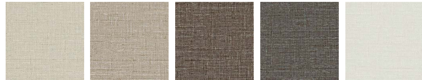
DN2-ELS-22 Rockport DN2-ELS-23 Earl Grey DN2-ELS-24 Bombay DN2-ELS-25 City Storm DN2-ELS-26 Soft White