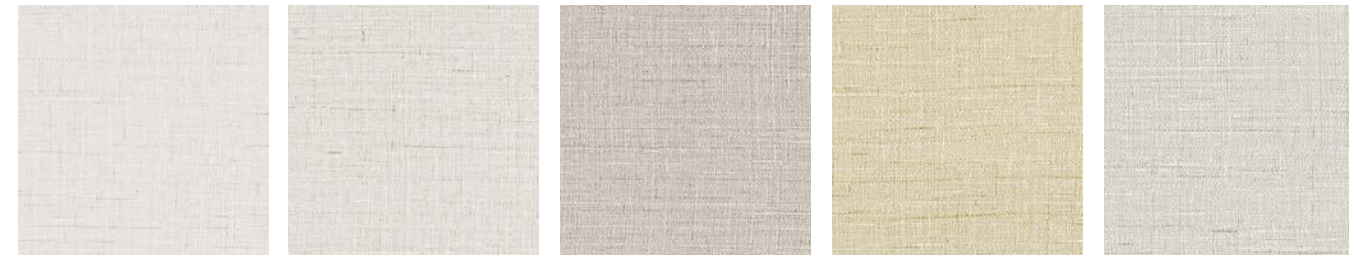
DN2-ELS-07 Canvas DN2-ELS-08 Sand DN2-ELS-10 Pongee DN2-ELS-20 Irish Linen DN2-ELS-21 Sail Cloth