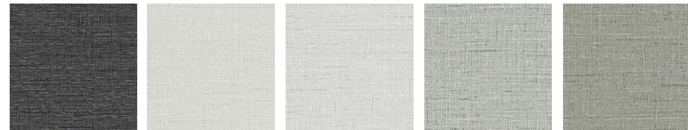
DN2-ELS-27 Hematite DN2-ELS-28 Veil DN2-ELS-29 Shaker White DN2-ELS-30 Sailor DN2-ELS-31 Grey Area