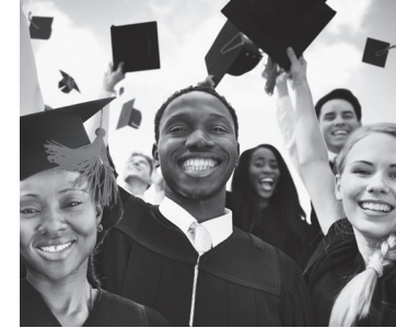
Take Command Scholarship