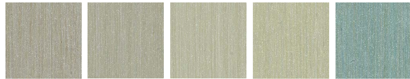
DN2-AST-06 Urban Putty DN2-AST-07 Dovecoat DN2-AST-08 Canyon Cloud DN2-AST-09 Mint Sorbet DN2-AST-10 Sail Away