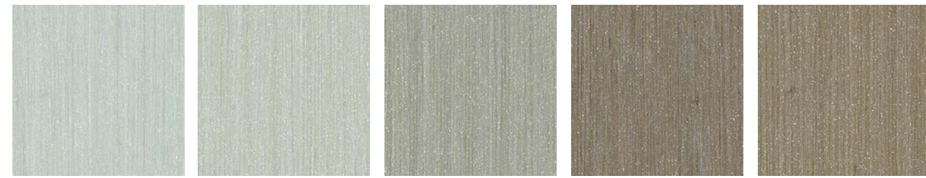
DN2-AST-01 White Frost DN2-AST-02 Dockside DN2-AST-03 Grey Ombre DN2-AST-04 Abby Stone DN2-AST-05 Silt