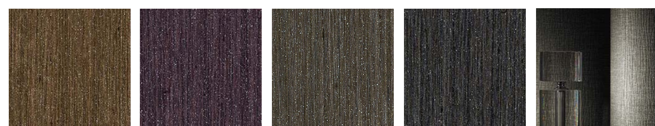
DN2-AST-21 Hazelnut DN2-AST-22 Brunello DN2-AST-23 Peppercorn DN2-AST-24 Black Iron FOR SIMILAR TEXTURES CLICK HERE

Type II 20 oz | Width: 52"/54" | Backing: Non-Woven | Match: Random Match Reversible Pattern Repeat 26"H x 24" V | Fire Rating: Class A | Flame Spread: 10 | Smoke Development: 10