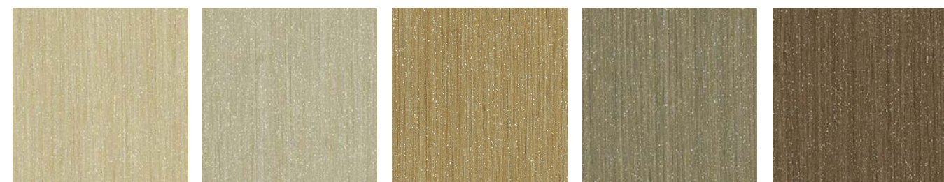
DN2-AST-16 Pecorino DN2-AST-17 Fallo DN2-AST-18 Final Straw DN2-AST-19 Olivine DN2-AST-20 Arrowhead