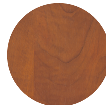
Medium Cherry N575