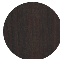
Dark Walnut N578