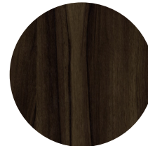
Noce Secchia N601