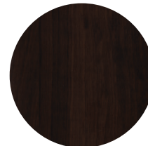
Espresso Apple N573