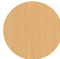
Light Maple N571