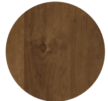
Rustic Alder N602