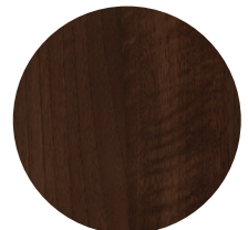
Medium Walnut N577