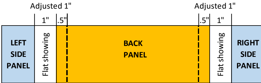
Ex: 2" adjustment