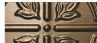
Bead + Button